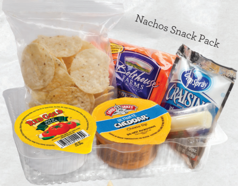
Nachos Snack Pack