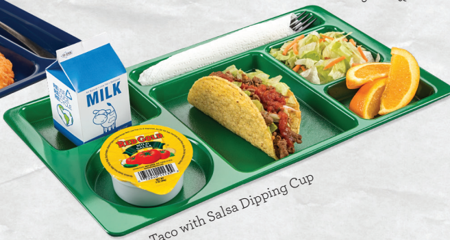
Taco with Salsa Dipping Cup