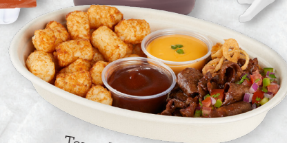
Texas BBQ Tostitos