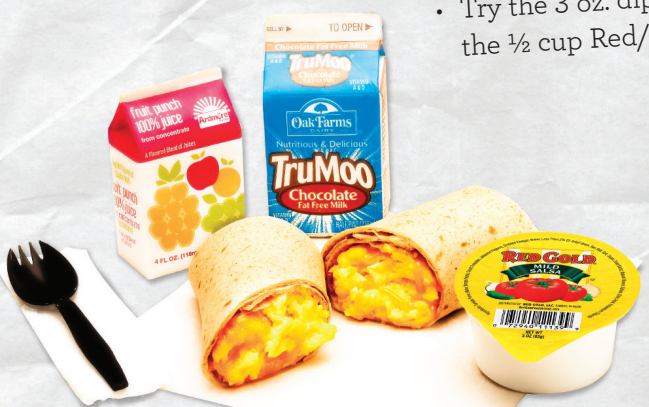
Grab-and-Go Breakfast with Salsa Cup

Need a cost-effective alternative to fruit that's just as healthy? • Try the 3 oz. dipping cup of Red Gold Salsa that meets the 1/2 cup Red/Orange vegetable requirement