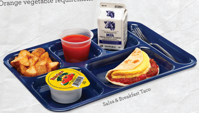
Salsa & Breakfast Taco