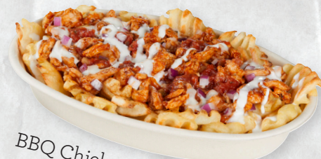
BBQ Chicken Waffle Fries

Check with your local representative on our Dispenser Program options for your locations.