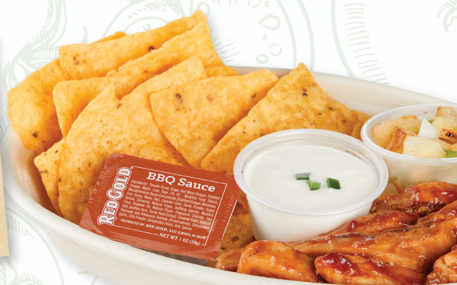
Hawaiian BBQ Nachos

Visit RedGoldFoodservice.com to request a Free Sample today!