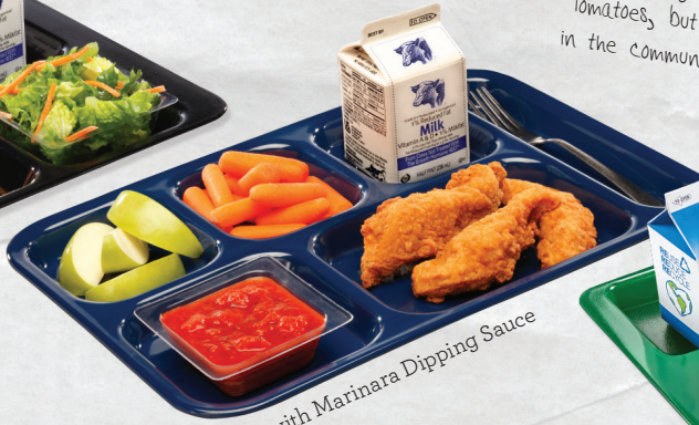
Chicken Tenders with Marinara Dipping Sauce