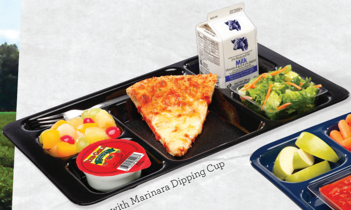
Pizza with Marinara Dipping Cup