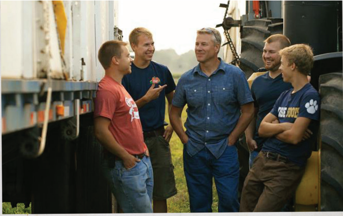
Paarlberg Family Farm